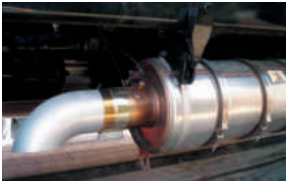
Three-Way Catalyst Aftertreatment

The ISL G is capable of operating on compressed or liquefied natural gas (CNG, LNG). The ISL G can also operate on up to 100% biomethane – renewable natural gas made from biogas or landfill gas that has been upgraded to pipeline and vehicle fuel quality. Biomethane fuel is carbon dioxide (CO 2 ) neutral and using it as fuel reduces vehicle greenhouse gas emissions by up to 90%.